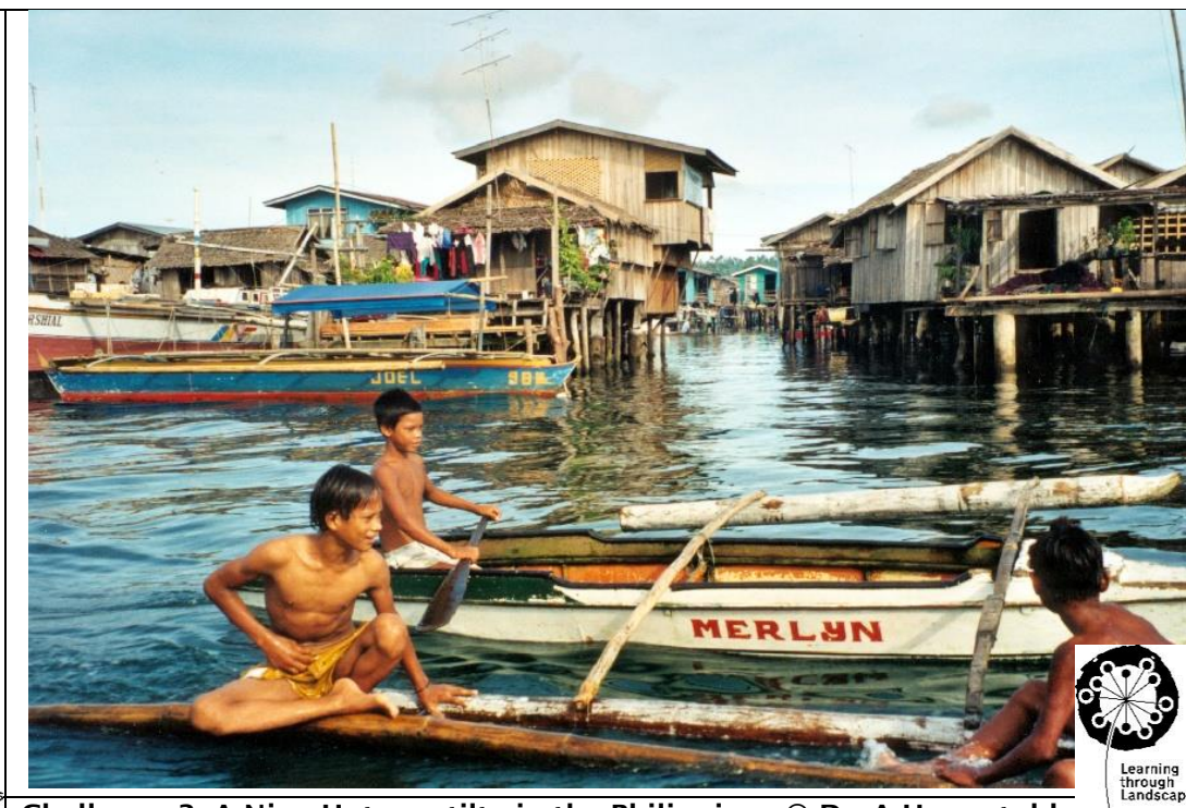
Challenge 3: A Nipa Hut on stilts in the Philippines