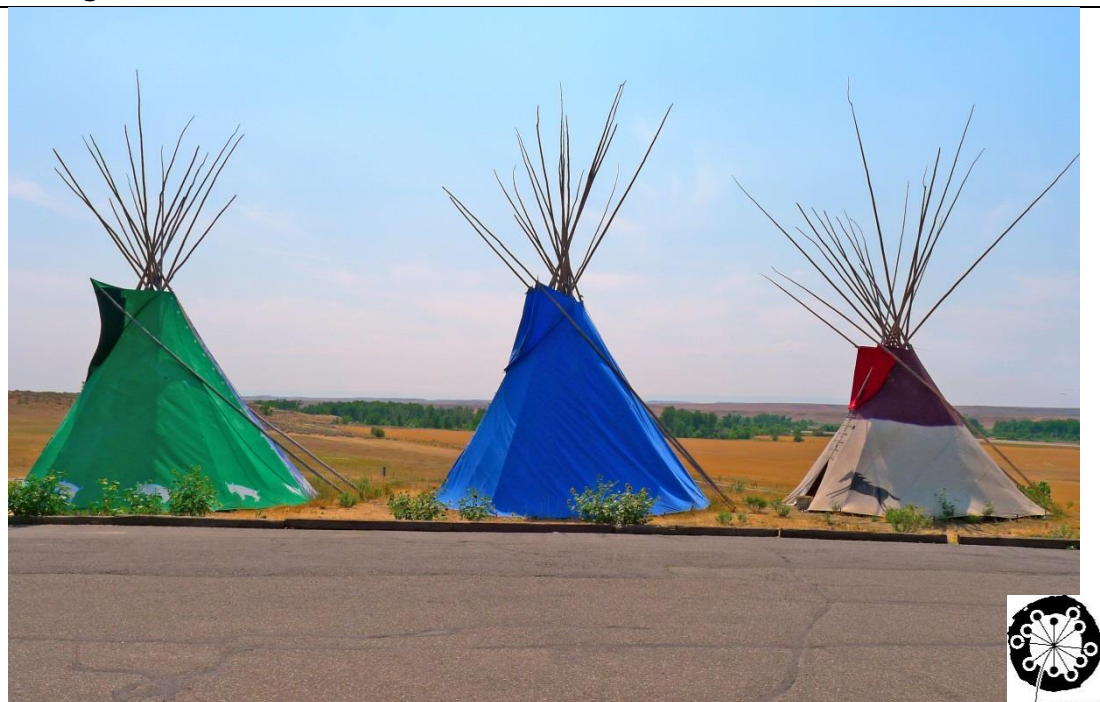
Challenge 2 : Three Blackfoot Tepees in Montana