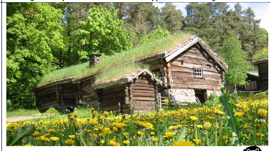
Challenge 4: Log House with Grass Roof in Norway