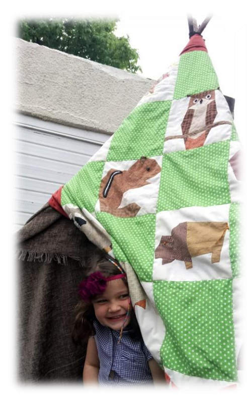
Tribal tepee made with sticks, string, pegs and blankets

IRL - Geography>Human Environment> Settlement: Homes and other buildings (All year groups)